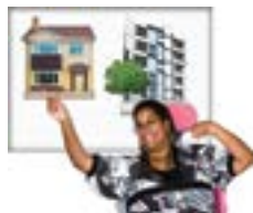
Where you live