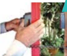
Staying safe and travel