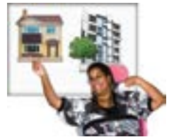
Where you live