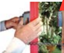
Staying safe and travel