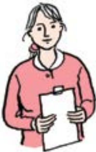
...a care inspector