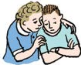
...staff who support you