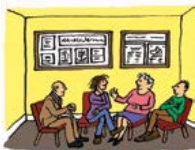
...at a care home