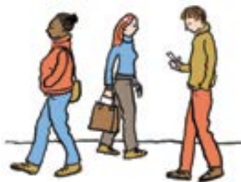
...in a public place