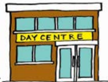
...at a day centre