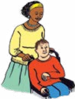
...a housing support worker