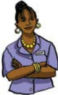
...a social worker