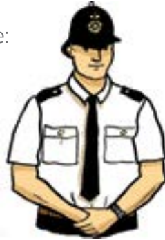
...a police officer