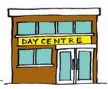
...at a day centre