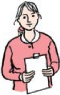
...a care inspector